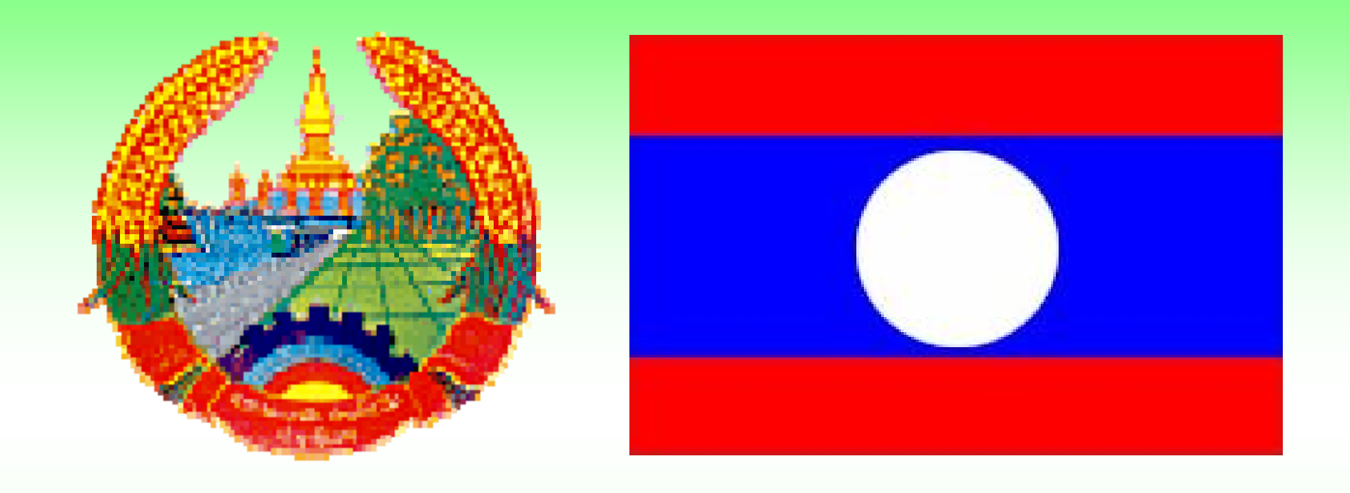
The Emblem and National Flag of Laos