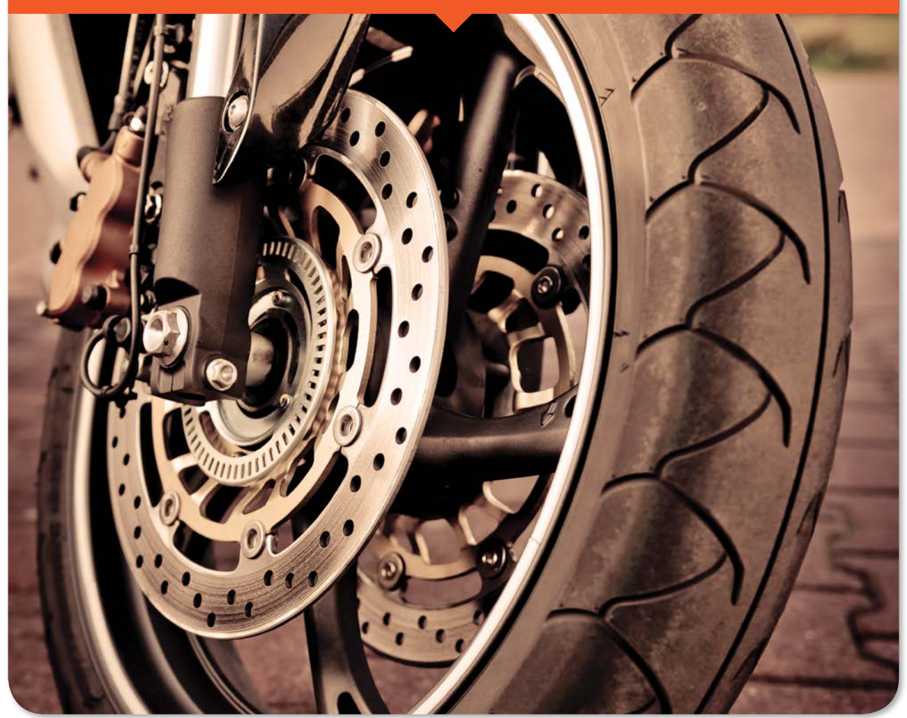
Anti-lock Braking System (ABS) has been shown to reduce braking distance and motorcycles with ABS technology have been shown to be involved in fewer crashes on the road.

Educating people about vehicle safety features as part of the broader educative approach will help change attitudes, behaviours and practices which affect people's safety on the road. The benefits of buying safer vehicles as part of workplace safety obligations and encouraging take up to protect the most vulnerable and inexperienced drivers will also be encouraged.